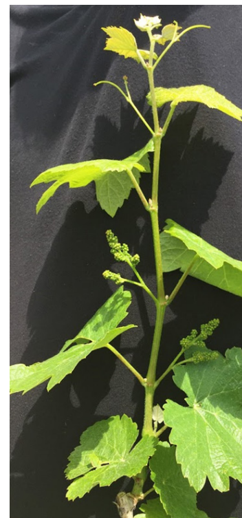
Figure 3. The earliest stage to begin shoot thinning (left; approximately 3 inches), an ideal stage to shoot thin (center; approximately 5 to 7 inches), and the latest stage to efficiently shoot thin before shoots lignify at the base and tendrils grab neighboring shoots (right; approx. 10 to 12 inches).