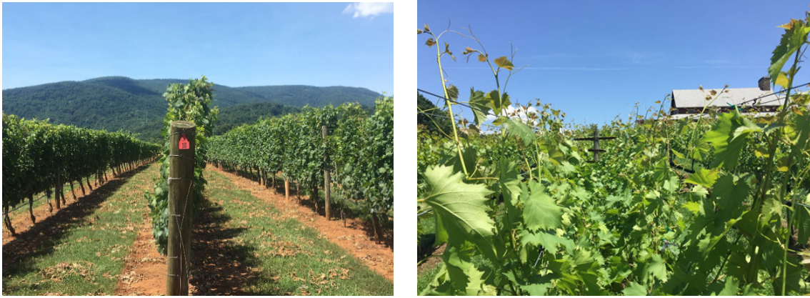
Figure 6. The most popular wine grape training system in the world, a vertical-shoot-positioned (VSP) system (left); a VSP system that has been retrofitted with several trellis cross arms to divide the canopy and increase light interception and porosity (right).

An excessive crop may fail to reach commercial maturity in a timely manner when an increase in shoot number does not equate to an increase in exposed leaf area. Note that the crop can increase with shoot number, but high shoot density does not necessarily equate to greater light interception in the ubiquitous vertical-shoot-positioned (VSP) system (Figure 6). The “ceiling” for light interception in the VSP system is a function of foliar self-shading that occurs as a result of the space limitations of 6- to 8-inch-spaced catch wires. On the other hand, greater shoot numbers can increase both crop and light interception in training systems that have one fruit zone and a divided canopy (Figure 6). The increased space in the fruit zone and canopy in such systems may permit the retention of greater shoot densities while maintaining crop health and quality. Thus, greater shoot densities may be retained in divided, single-cordon training systems (e.g., Watson, Ballerina, “Y”, or “split” VSP trellis, and Smart-Dyson) relative to nondivided systems (e.g., VSP; single high wire). The UGA Extension Viticulture Team is currently evaluating the effect of various shoot densities and pruning methods on crop quantity and quality in both divided and nondivided VSP canopies.