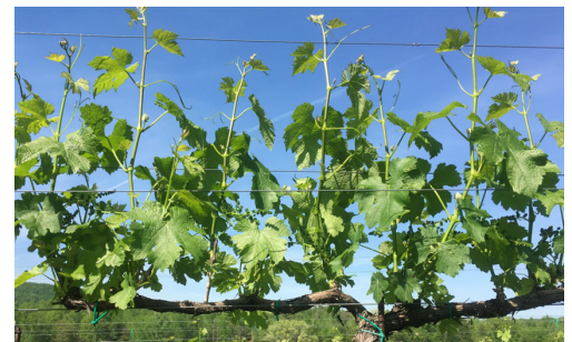
Figure 5. An optimal shoot density of roughly four shoots per linear foot of cordon in ‘Merlot’ at the prebloom stage; shoots were thinned roughly one week before the photo was taken.