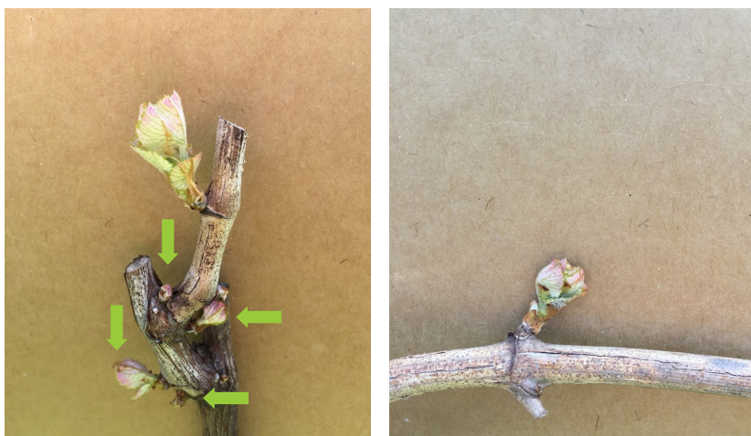
Figure 1. Developing buds will become shoots in spur-pruned (left) and cane-pruned (right) systems. Note the excessive noncount/latent (green arrow) bud number in the right photo; buds will develop into shoots and will need thinned out to maintain canopy porosity. For more information on shoot thinning requirements related to pruning method, see Hickey and Hatch (2018).

excessive shoot density without a tandem increase in crop. Relative to spur pruning, cane pruning limits the number of latent and basal noncount shoots (Table 1; Figure 1). Less shoot thinning is required when practicing cane relative to spur pruning. This is of particular importance if the availability of vineyard labor is more limited in the springtime than during the dormant period. Unwanted increases in shoot density can be further compounded if vines are pruned to excessive count bud numbers (greater than three to five per linear foot of cordon) when aiming to offset the threat of cold injury or spring frost. If neither cold injury nor frost damage occurs, shoot numbers will be too excessive for desirable canopy and crop health. Shoot thinning is highly important to achieve recommended shoot densities in this situation.