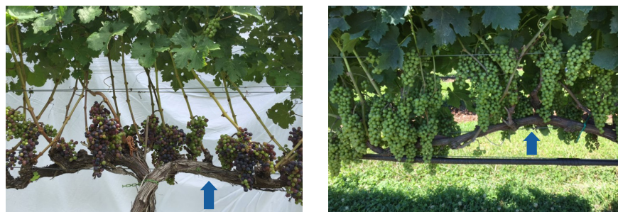
Figure 2. An optimal cluster and shoot density in 'Cabernet Sauvignon' at veraison (color change and sugar accumulation) (left) and an overly congested 'Merlot' fruit zone at bunch closure (right). Note: the pictures show vines that are spur-pruned and trained to cordons (blue arrows).

It is important to thin shoots because excessive shoot density will increase the incidence of cluster touching and bunch rot. Canopy and cluster congestion will increase the amount of time it takes for tissues to dry and will further limit fungicide spray penetration. We do not need help promoting fungal diseases in our humid climate. Therefore, shoots should be thinned in the spring to optimize canopy porosity, maintain cluster health, and produce a balanced crop yield. The right photo in Figure 2 was the result of two factors: one, excessive bud number retention at pruning; and two, failure to shoot thin in the spring. The shaded parts of the several touching or overlapping clusters will be prone to bunch rot and have poor color and varietal character development (Fiola, 2017). The left photo in Figure 2 shows an optimal shoot and cluster density that allows good fungicide coverage and sunlight penetration into the fruit zone.